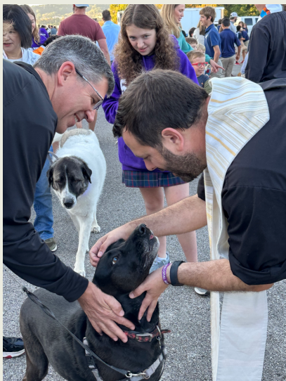
Blessing of the Pets